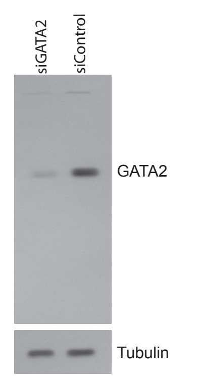
Fig2. GATA2 antibody specificity was determined in SHSY5Y cells by transfection with GATA2 siRNA. Control siRNA was used for a mock transfection. Whole cell lysates were analysed by Western blot using antibodies against GATA2 and tubulin. As shown, GATA2 protein levels were reduced when treated with siGATA2, but not in the mock sample. The loading control tubulin remained the same.

Fig1 Western Blot analysis using K562 whole cell extract